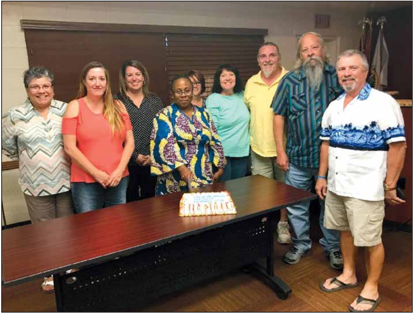
The Town of Youngtown would like to congratulate the 5th Citizens’ Academy Graduates. We had a fabulous time engaging with citizens that participated in the nine-week session.